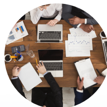
Project Teams Sector Specific