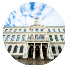
State Councils sector specific