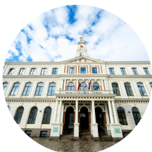
National Councils sector specific